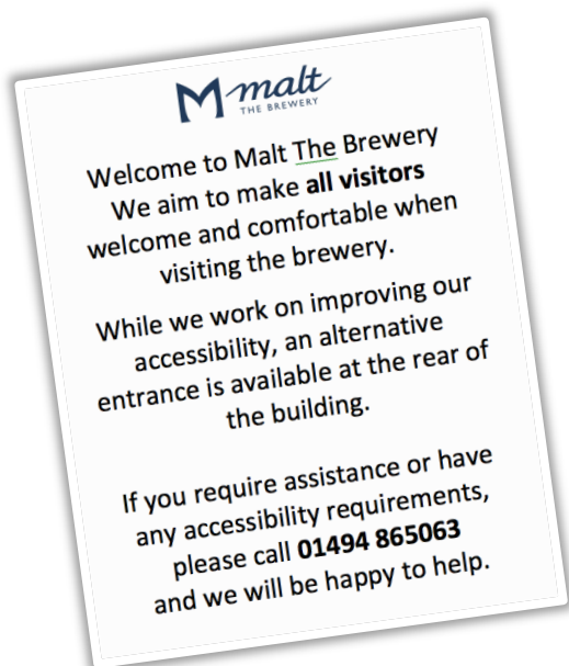
Sign at main entrance